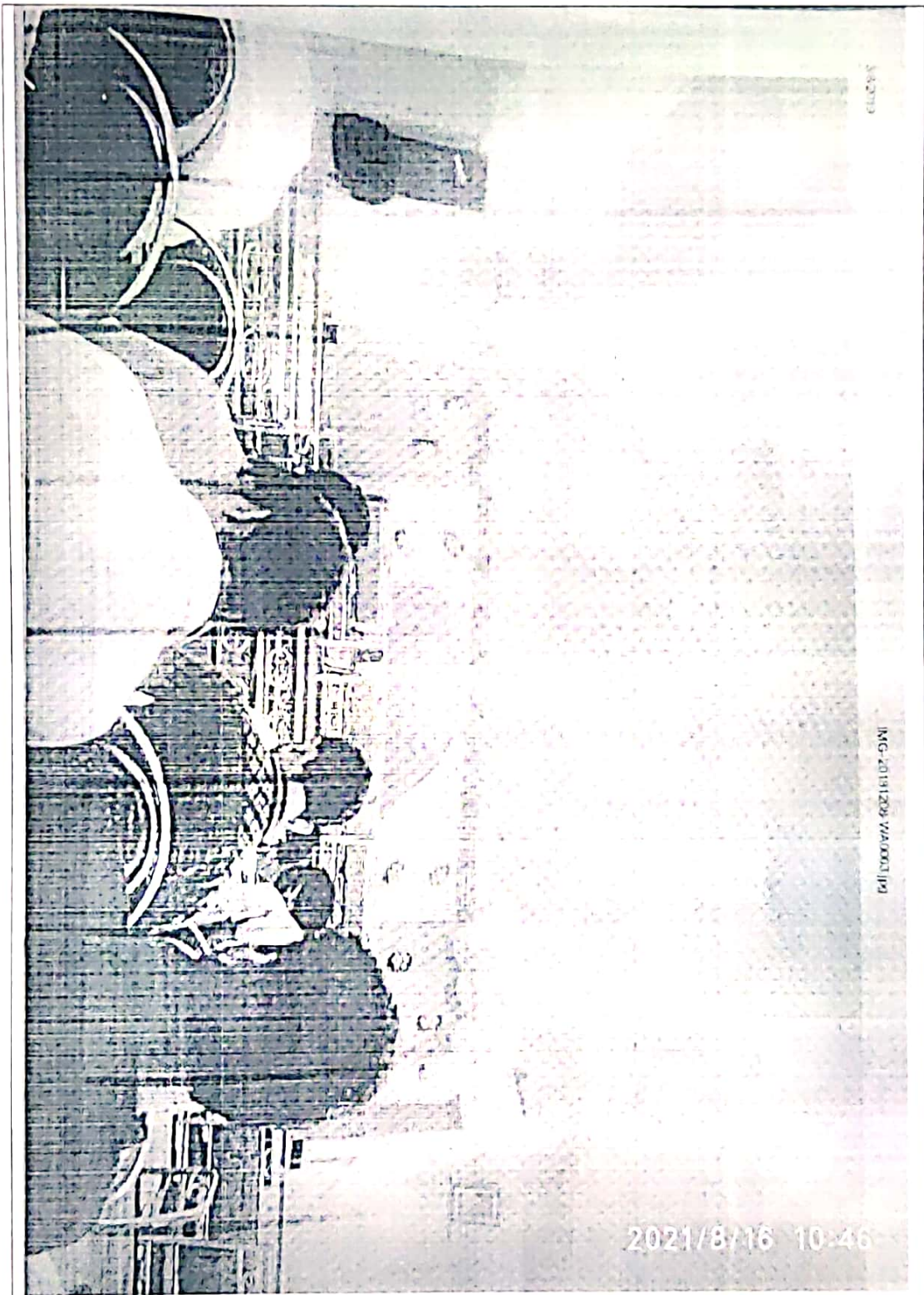
SC/ST students attended the meeting hosted by Andhra Pradesh State Finance Corporation, Government of A.P on Schemes for SC/ST students to become Entrepreneures